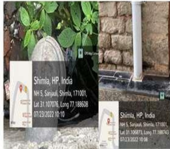
PVC pipes used to reach the rain water to the tank from various buildings' roof