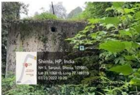
Rain Water Harvesting Tank