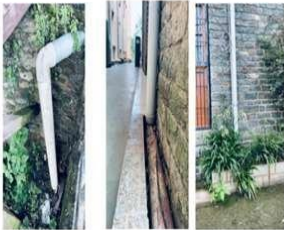
PVC pipes used to reach the rain water to the tank from various buildings' roof